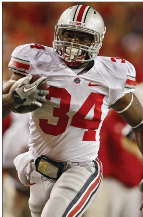
Carlos Hyde ran for 104 yards, including this 63-yard touchdown, during last year's game in Lincoln.