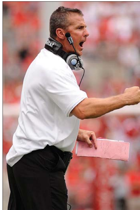
Head coach Urban Meyer and the Buckeyes posted a 56-10 win over Miami (OH) in Meyer's debut as OSU head coach.