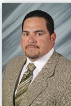
ETI ENA Defensive line Eastern Washington 2005