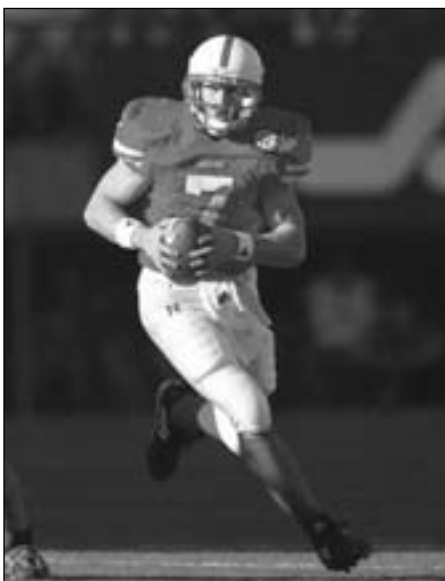
Eric Crouch, Quarterback (3,434 yards)