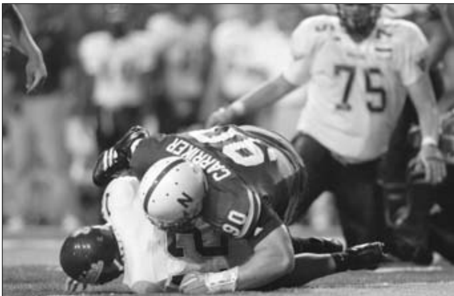
Nebraska tied a school record with 18 tackles for loss in the 2005 season-opening victory over the Maine Black Bears at Memorial Stadium. The 89 yards lost by the Black Bears tied for fifth in the school record book.

Most Total Turnovers: 47; 1972 (27 INT, 20 FL); 2003 (32 INT, 15 FL) Fewest Total Turnovers: 19; 1962 (9 INT, 10 FL); 1993 (10 INT, 9 FL); 2000 (14 INT, 5 FL) Most Fumbles: 48; 1976 (30 lost) Fewest Fumbles: 14; 2000 (5 lost) Most Fumbles Lost: 30; 1976 (48 fumbles) Fewest Fumbles Lost: 4; 1994 (18 fumbles) Most Interceptions Thrown: 32; 2003 (259 yards) Fewest Interceptions Thrown: 6; 1961 (84 yards) Most Interception Return Yards: 523; 1970 (30 INT) Fewest Interception Return Yards: 49; 1954 (8 INT) Most Interception Return Touchdowns: 5; 1971; 1995