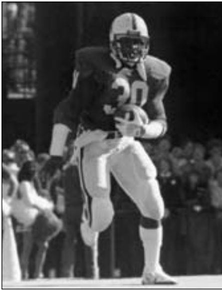
Mike Rozier, I-Back (4,780 yards)