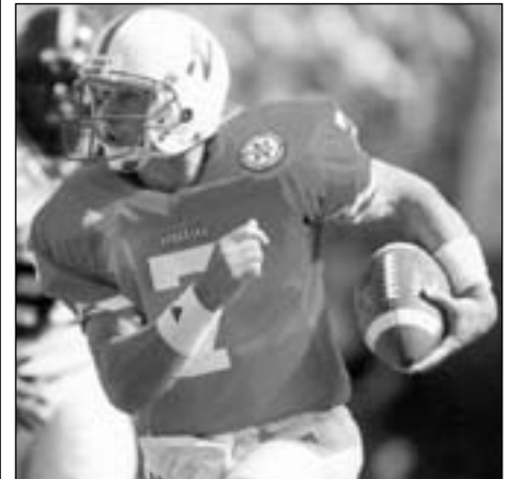
Eric Crouch (1998-99-2000-01)