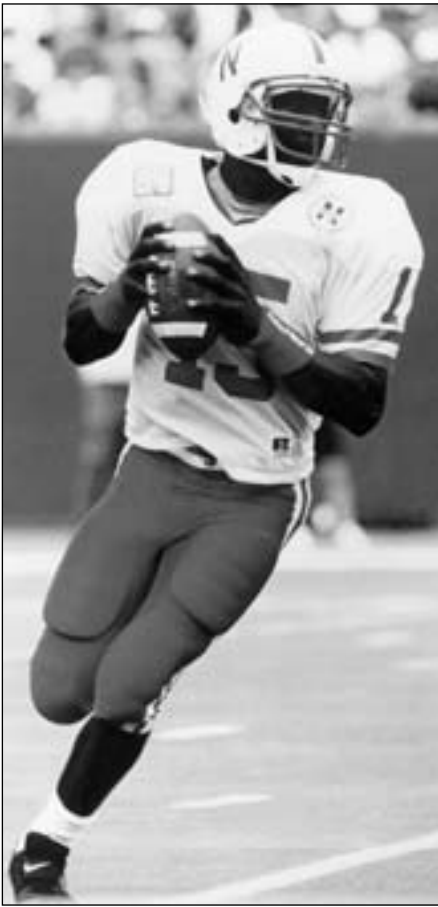
Tommie Frazier (1992-93-94-95, 3,521 yards)