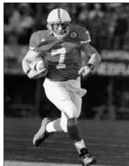
Eric Crouch, Quarterback, 368 points