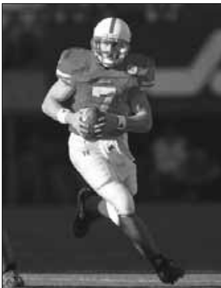
Eric Crouch, Quarterback (3,434 yards)