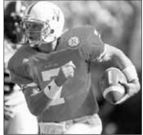
Eric Crouch (1998-99-2000-01)