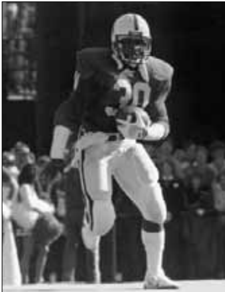
Mike Rozier, I-Back (4,780 yards)