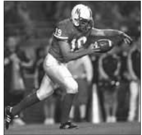
Kyle Larson (2001-02-03)